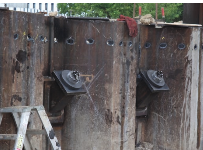
Image 2: Pre-tensioned line anchors prior to installation of the steel caps.

Image 1: Cross section and topview of anchor console design